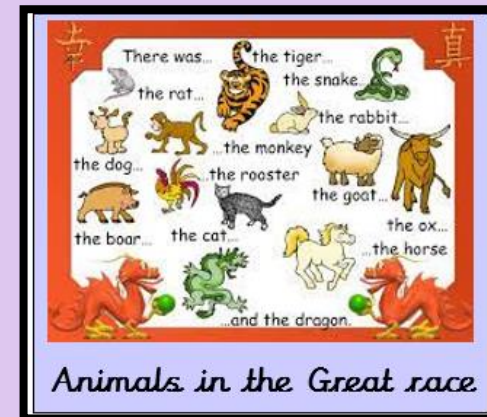
Animals in the Great race