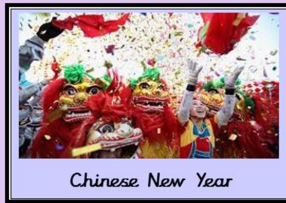
Chinese New Year