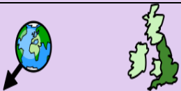
South west England

A city is a place where many people live closely together.