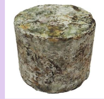
A wheel of Stilton cheese from the Wookey Hole