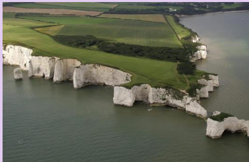
The Jurassic Coast