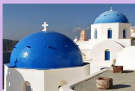
Church in Greece