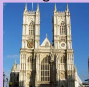
Church in England

Choose a place of worship to research and learn more about. You may want to compare that place between different continents E.g. compare a church in Greece with one in England.